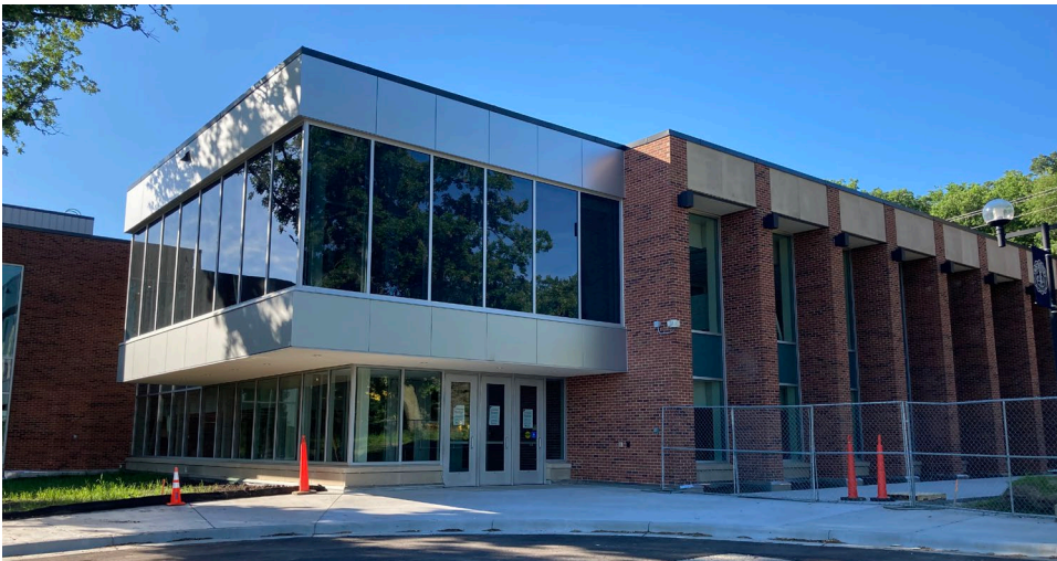
Figure 2 Project exterior image