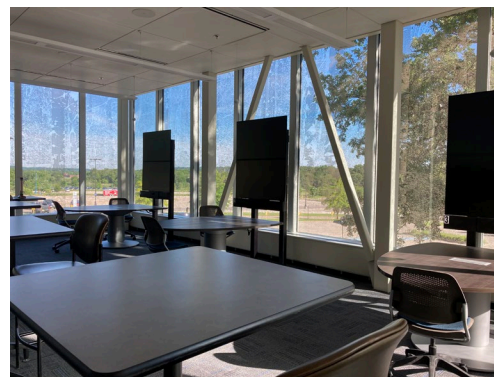
Figure 4 – Active Learning Classroom