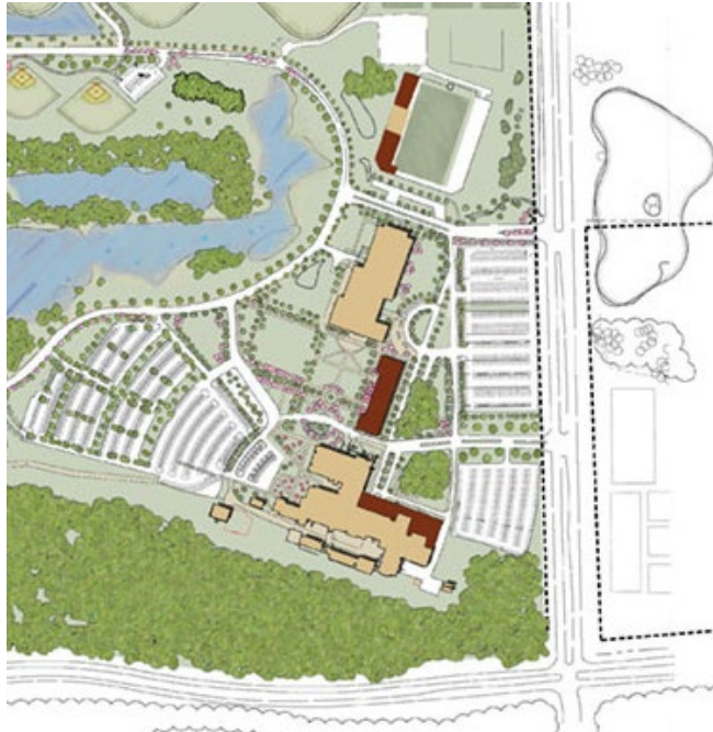
Figure 1 Campus Plan

Impact for students as a result of this project: